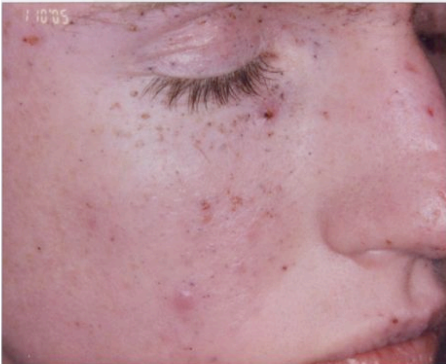
Figure 4- 3 days later after 2 nd treatment