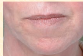
Four weeks after 3 treatments